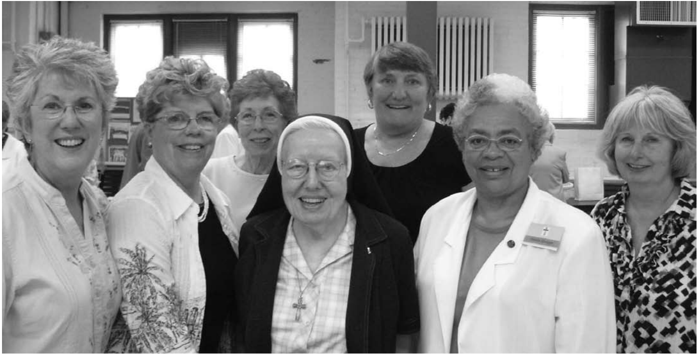
“Two Churches, One Big Reunion for Sisters, Alumnae, Associates, Family and Friends”