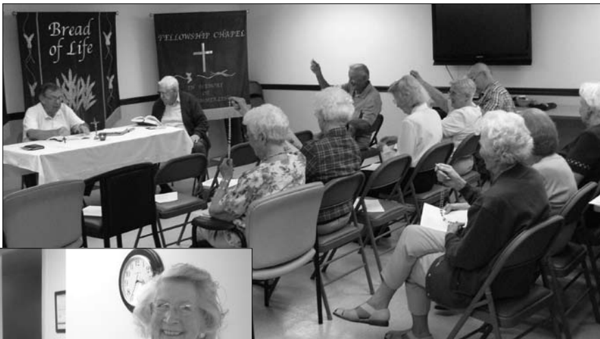
Above: The associates join others in the crowd to pray the rosary.