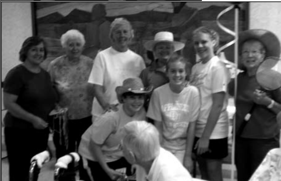
Volunteers pose for a photo following the party.