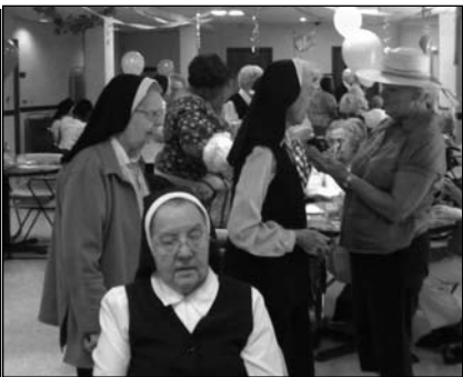
Sisters line up to play games.