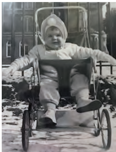
“Strolling” on the UA campus